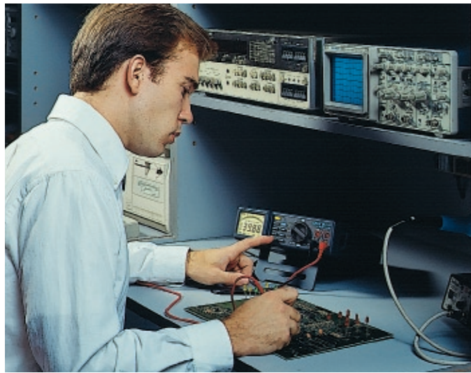
Designed for using in a laboratory