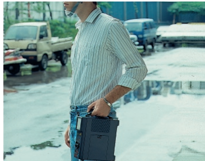
Handle carrying design for mobility.