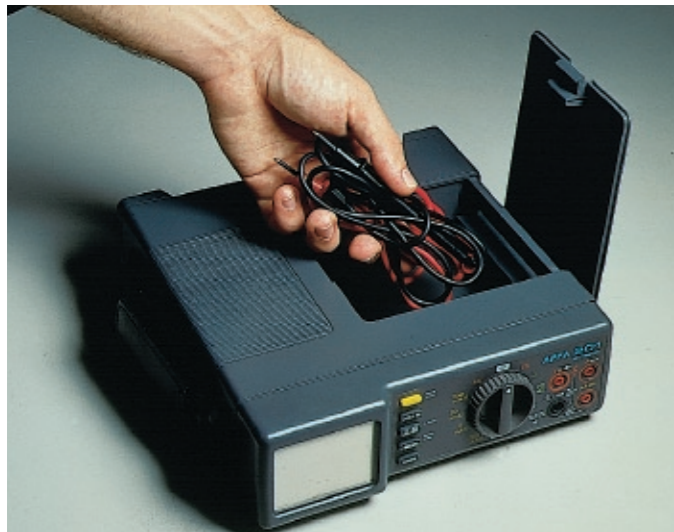
Extra back storage for full accessories.